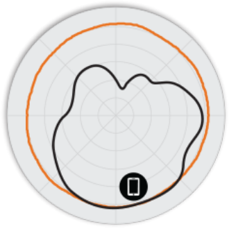
Figure 3. H320 5GHz Azimuth Antenna Patterns