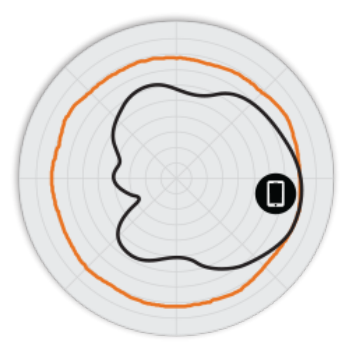
Figure 2. H320 2.4GHz Azimuth Antenna Patterns