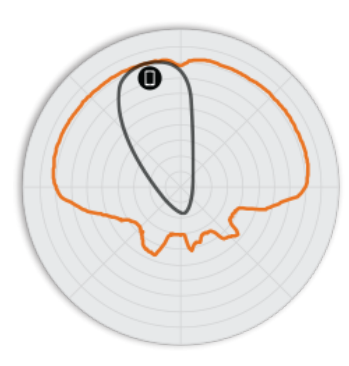
Figure 4. H320 2.4GHz Elevation Antenna Patterns